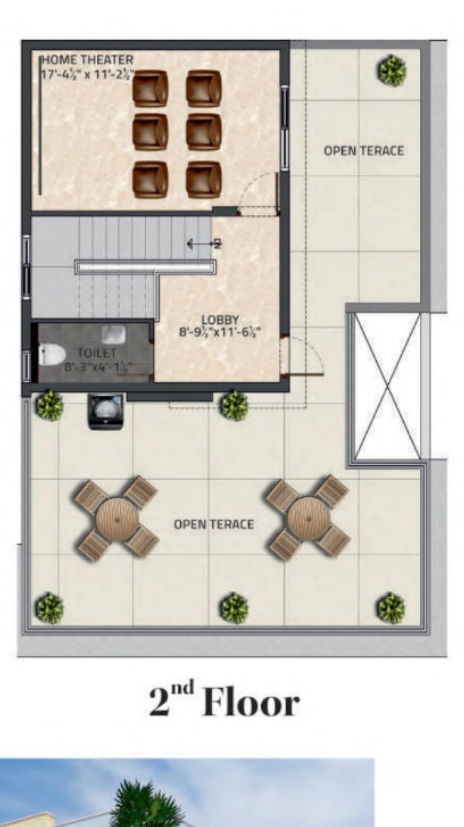
GROUND 1st 2nd FLOOR + FLOOR + FLOOR = BUILT-UP AREA 1,084 Sft. 1,216 Sft. 500 Sft.